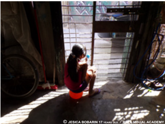
© JESICA BOBARIN 17 YEARS OLD / REZA VISUAL ACADEMY