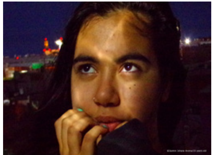
© JESSICA BOBARIN 17 YEARS OLD