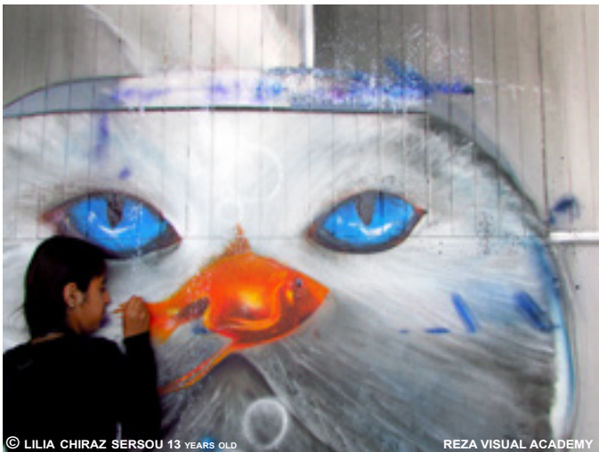
© LILIA CHIRAZ SERSOU 13 YEARS OLD